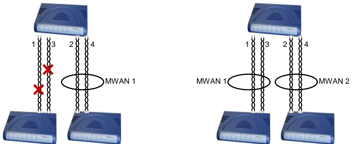
Figure 2.1 "Jumping" MWAN.

In previous software versions the MWAN naming process depended not only on the channel number (WAN1 ... WAN4) included into the bundle, but also on the channels activating order. It led to the situation where the MWAN with the same name MWAN1 pointed to different directions depending on the order what DSL link came up first. MWAN1 could be created on any channel including WAN2 and WAN4, but if second MWAN appears on WAN1 and WAN3, the previously assigned MWAN1 changed its allocation to new WAN1 and WAN3 channels, while MWAN2 appeared on WAN2 and WAN4. For example DSL2 and DSL4 came up first and MWAN1 appears on them. Then DSL1 and DSL3 came up too and MWAN1 "jumps" to DSL1 and 3 while MWAN2 appears on previously active DSL2 and 4.